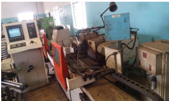
Fig1: CNC Cylindrical Grinding Machine