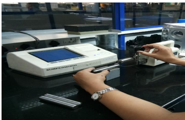
Fig 2: Surface Roughness Tester.